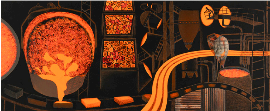
Roger Mello, Artwork for Charcoal Boys (Elsewhere Editions). Collection of the artist. © 2009 Roger Mello.