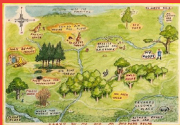
Open + Shut: Celebrating the Art of Endpapers Through November 9, 2025