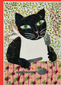
Cooking with Eric Carle September 20, 2025 – August 23, 2026