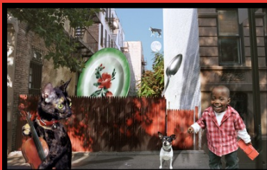
Click! Photographers Make Picture Books January 17 - June 7, 2026