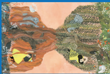
Sprites, Spells, and Splashes: Magical Beings in Picture Book Art November 22, 2025 - April 12, 2026